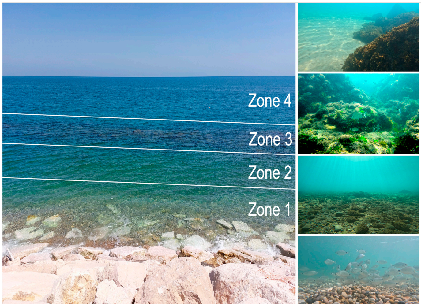
Figure 3. The picture shows the typical pattern of the Trabocchi Coast. Pictures of zones 1–4 from the outside ( left ). ( Right ) pictures of zones 1–4 (from bottom to top) taken underwater. From zone 1 (shoreline) to zone 4 (open sea), different bottom areas can be found, each one with a specific substrate and depth. In a handful of meters, the coast goes from pebbles to sand, and to cliffs at approximately 5 m depth. This is due to the geological evolution of the zone, which represents a unique distinctive trait of the central part of the Frentane coast.

was maintained at 1–3 m per minute. A second operator (PL, ADS) was present during each session to provide technical or emergency support.