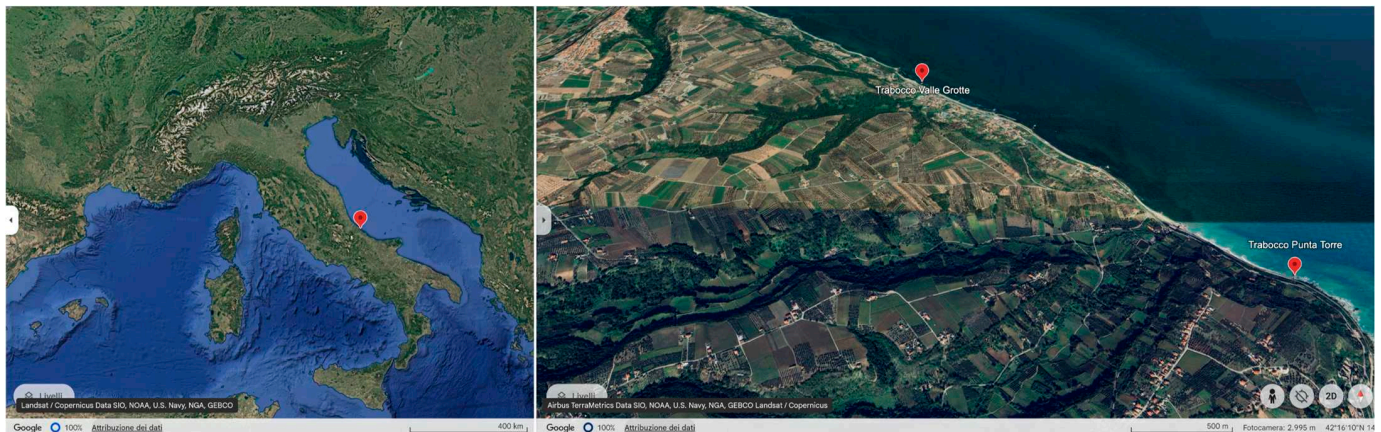
Figure 1. The location of the study areas along the mid-Adriatic A. Two locations were considered in this research: from 2011 to 2014, marine flora and fauna were recorded in the northern locality of Valle Grotte; from 2014 to date, the research has been carried out in the southern area of Rocca San Giovanni, both on the Chieti district, Abruzzo.

This study employed the UVS method through snorkeling and freediving across two sectors of the Trabocchi Coast along the Adriatic coastline in Chieti, Italy (Figure 1).