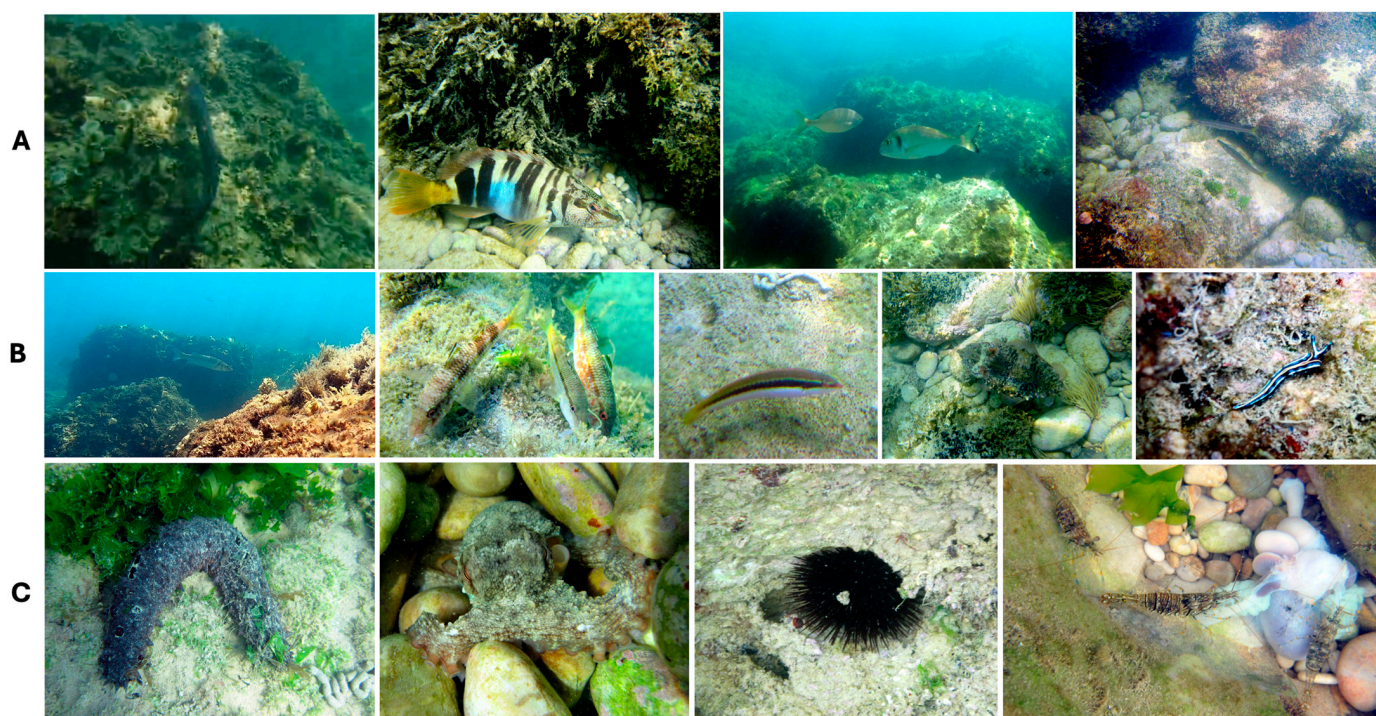
Figure 4. A few specimens recorded on the Trabocchi Coast. From left to right: Line (A): Conger conger , Serranus scriba , Sparus aurata and Sarpa salpa , Sphyraena sphyraena ; Line (B): Dicentrarcus labrax , Mullus surmuletus , Coris julius , Sepia officinalis , Thuridilla hopei ; Line (C): Holoturia tubulosa , Octopus vulgaris , Arbacia lixula , Palaemon elegans . More species are included in the supplementary files (Photo credits: A. Arbuatti).

Data from 2011 to 2014 refer to the first survey area, located between Vallevò and Valle Grotte, 42°17'31" N, 14°28'24" E; data from 2015 to present refer to the second study site, Punta Torre in Rocca San Giovanni, 42°16'26" N, 14°29'95" E. ✓: present in the area. Age categories; A, adult; J, juvenile. Zone 1 comprises underwater pebbles near the shoreline; Zone 2 is made of transitional substrate with sand, mud, gravel, scattered rocks, and small reef fragments; Zone 3 consists of the reef, and Zone 4 is the open sea. Commercial interest follows the definition of Fishbase.org [20]. Some species listed in Table 3 are included in Figure 4.