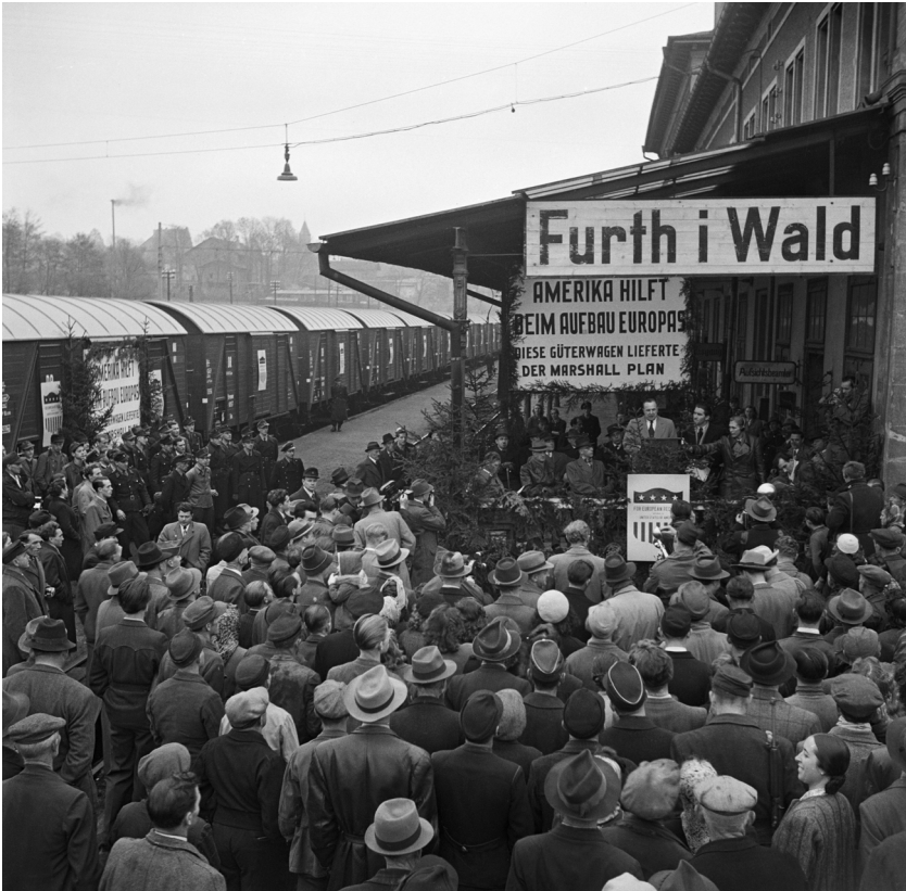
13. Marshall Plan freight cars arrive at the German town of Furth im Wald, near the Czech border.

In France, Britain, Italy, and Germany, Marshall aid was deployed by national governments in a context framed by national politics and priorities: Washington could cajole, and sometimes insist, but the real decisions on how to deploy the aid were left to European governments. With respect to economic policy, Marshall aid was, as one historian has written, Washington's "feeble weapon." 13 But this was precisely part of the genius of the scheme. In restoring economic choices to Europeans, the Marshall Plan also restored political choices. American aid helped boost economic activity and gave the parties of the center-right that had won this generous support credibility and