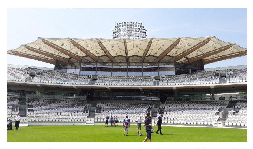
Figure 5.1: The New Warner Stand at Lord's Cricket Ground (Photo: Andrew Smith).

4.2 billion (Eurosport 2015). Consequently, many domestic and international tourists want to attend a live match or visit the stadium of EPL teams when they come to London.