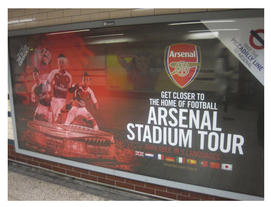
Figure 5.2: Poster on the London Underground Advertising Tours of Arsenal Football Club (Photo: Andrew Smith).