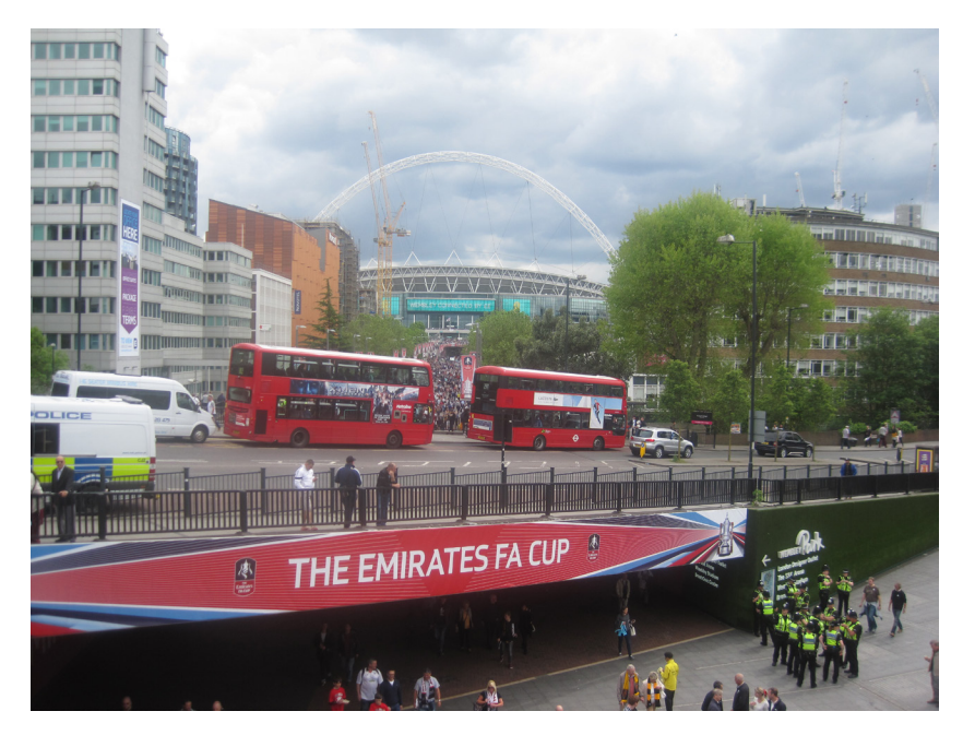
Figure 5.3: Wembley Stadium on FA Cup Final Weekend.

The lack of a home ground has not put paid to Tottenham Hotspur stadium tours, with specialist 'Spurs at Wembley' tours offered on the days adjacent to their home matches. Furthermore, the importance of serving the visitor market is revealed as the club has already announced that tours will be available at the new stadium when completed. The new stadium has been designed to incorporate a permanent visitor centre, housing a museum and Hall of Fame.