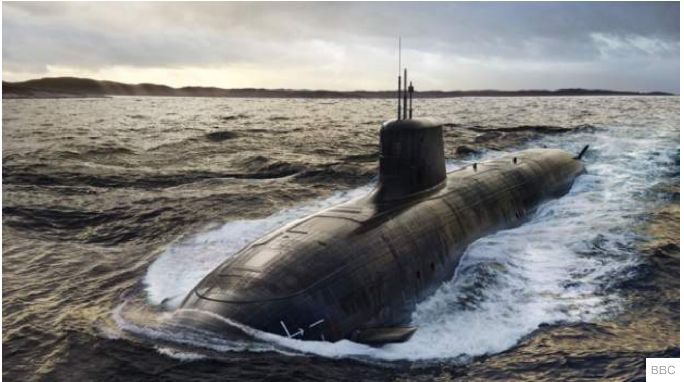
Mocked-up images of the new SSN-AUKUS submarine

Dubbed the SSN-AUKUS, the new model of nuclear-powered attack submarine will be built in Britain and Australia to a British design.