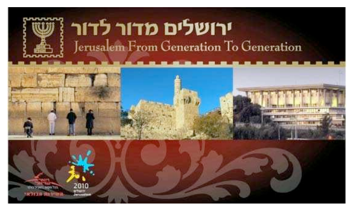
Fig. 4a: "Jerusalem - From Generation to Generation" Prestige Booklet 45