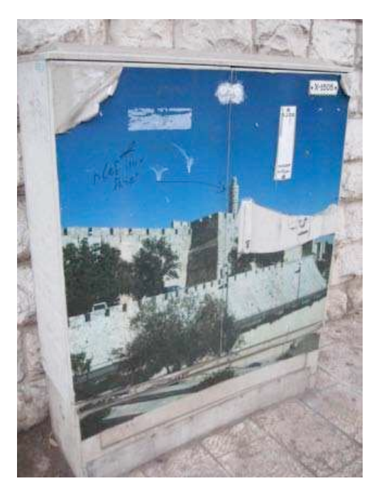
Fig. 3a: Poster on an electrical box