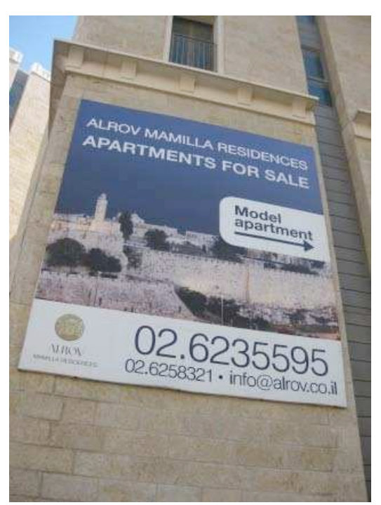
Fig. 3c: Alrov Mamilla Residences