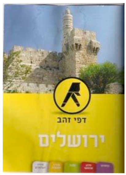
Fig. 4c: Jerusalem telephone book