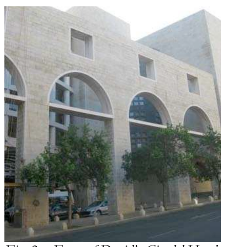
Fig. 2c: Front of David's Citadel Hotel