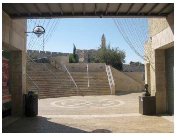
Fig. 2d: Alrov Mamilla's eastern opening with a tunnel view to the Tower of David