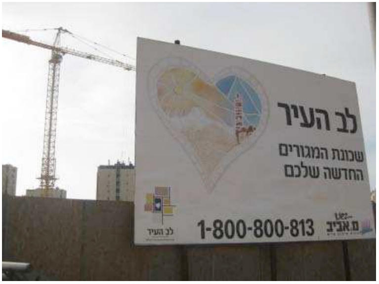
Fig. 3d: Lev ha-Ir neighborhood construction complex

Taken in May 2010, Fig. 3a shows a poster on an electrical box, a common element in the urban topography of Jerusalem. The poster presents the familiar frontal image of the Tower, with the upper third showing blue sky (connoting Israel's national blue-and-white flag). Graffiti appears on the poster. It reads in Hebrew, "Outside Israeli territory," with an arrow pointing directly to the Tower of David. To the right of the Tower, part of the poster is peeled away