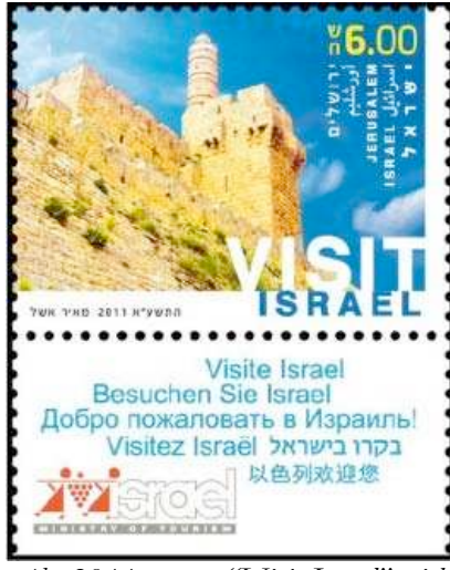
Fig. 4b: 2011 stamp "Visit Israel" with prominent view of the Tower of David<sup>46</sup>