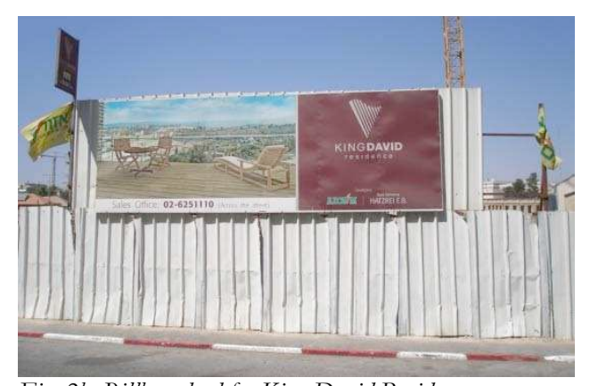
Fig. 2h: Billboard ad for King David Residence