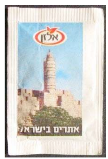
Fig. 4d: Sugar packet found in a restaurant

Stamp-collecting has been a popular pastime in Israel for several generations, and each year the Israeli Postal Service issues a series of new stamps and related collectables. A 2010 issue of a Jerusalem stamp album series is called 'Jerusalem from Generation to Generation'—Prestige Booklet (Fig. 4a). The cover of the album displays three images emblematic of Jerusalem: The Kotel on the left, the Knesset on the right, and the Tower of David in the center. This Prestige Booklet costs 49 NIS (around 13 USD or 10 €). According to the description, "This booklet tells the story of the city of Jerusalem. It includes