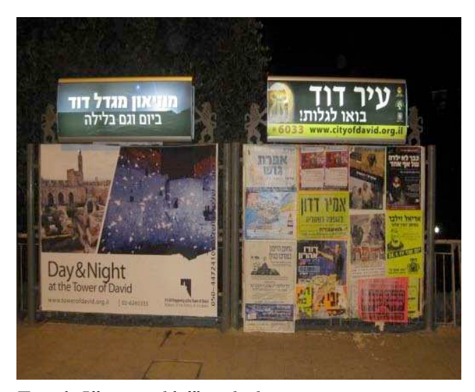
Fig. 3b: Illuminated billboard ads