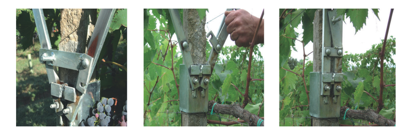
Figure 2. The device used to open and close the Y-shaped structure mounted onto each stake of the Sangiovese vineyard. A 1.1 m, V-shaped galvanised iron frame with an overall aperture angle of 50° were used to divide the canopy in two sloping walls. This structure remained open from just before bud-burst (begin of March) to harvesting and then was closed just before grape harvest (approximately half of September).

an inclined shoot-positioned trellis type. The study was designed to evaluate the SAYM and the vertically shoot-positioned (VSP) trellis types in order to: (i) establish the effects of the training systems on vine growth, canopy characteristics, yield components, grape composition and wine quality; and (ii) assess if with the SAYM, it is possible to combine the presence of an open and divided canopy during the vegetative season with the use of conventional machines during the harvesting and pruning operations after closing the structure just before grape harvesting.