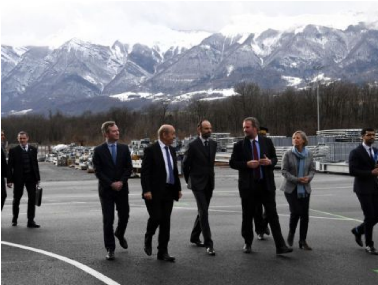
FRENCH PRIME MINISTER EDOUARD PHILIPPE, FLANKED BY JUNIOR MINISTER IN CHARGE OF DISABLED PEOPLE SOPHIE CLUZEL (2R), FRENCH JUNIOR MINISTER FOR FOREIGN AFFAIRS JEAN-BAPTISTE LEMOYNE (3L) AND FOREIGN AFFAIRS MINISTER JEAN-YVES LE DRIAN (4L).

The European Union will no longer make trade deals with the United States if President Trump follows through on withdrawing from the Paris climate agreement, according to a French official whose comments were endorsed by the European Commission.