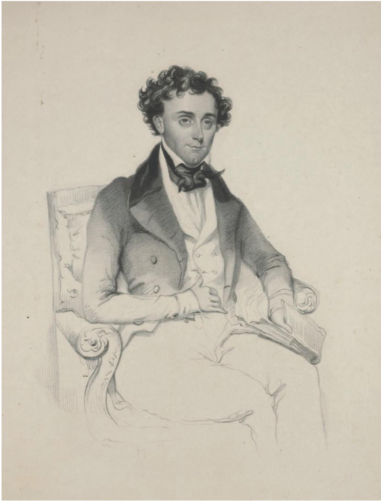
The blackface performer Thomas Dartmouth Rice (T. D. Rice), who pioneered the “Jim Crow” character, in a portrait from the mid-1800s.

The truth is more bounteous and more spiritual than that, more confused. That confusion is the DNA of the American sound.