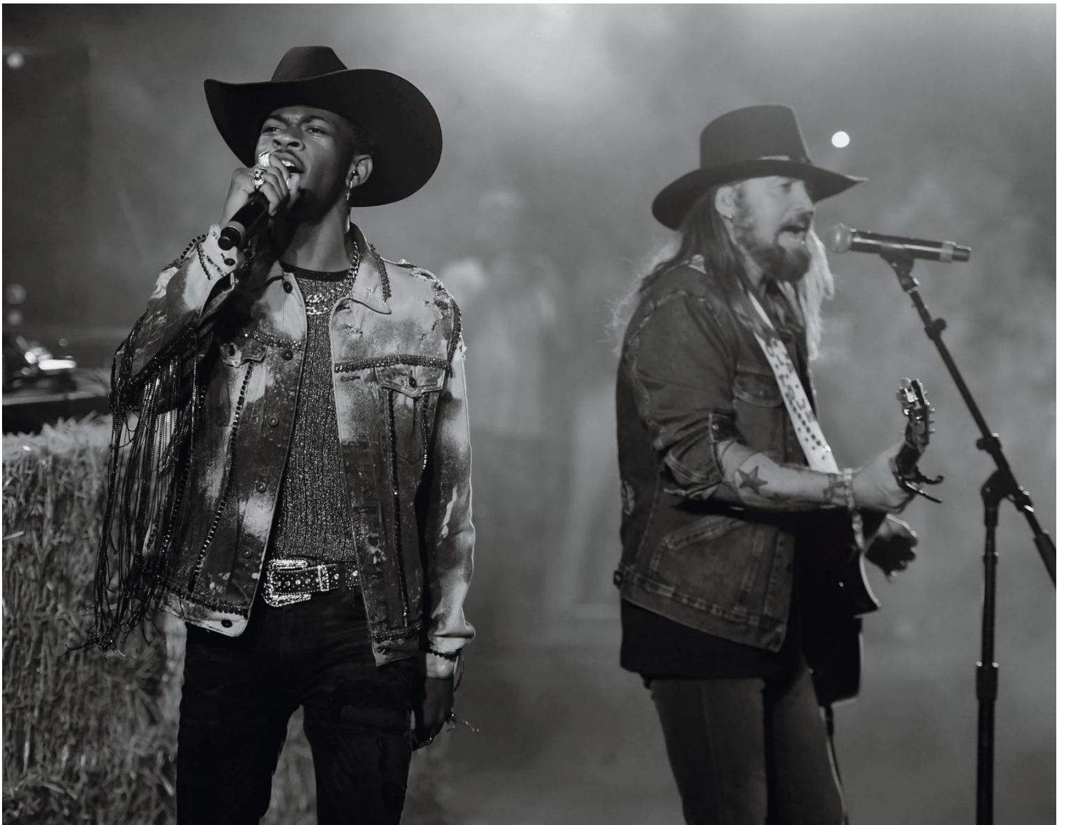
Lil Nas X, left, and Billy Ray Cyrus perform in Indio, Calif., in 2019.

fantasy. The song snowballed into a phenomenon. All kinds of people — cops, soldiers, dozens of dapper black promgoers — posted dances to it on YouTube and TikTok. Then a crazy thing happened. It charted — not just on Billboard’s Hot 100 singles chart, either. In April, it showed up on both its Hot R&B/Hip-Hop Songs chart and its Hot Country Songs chart. A first. And, for now at least, a last.