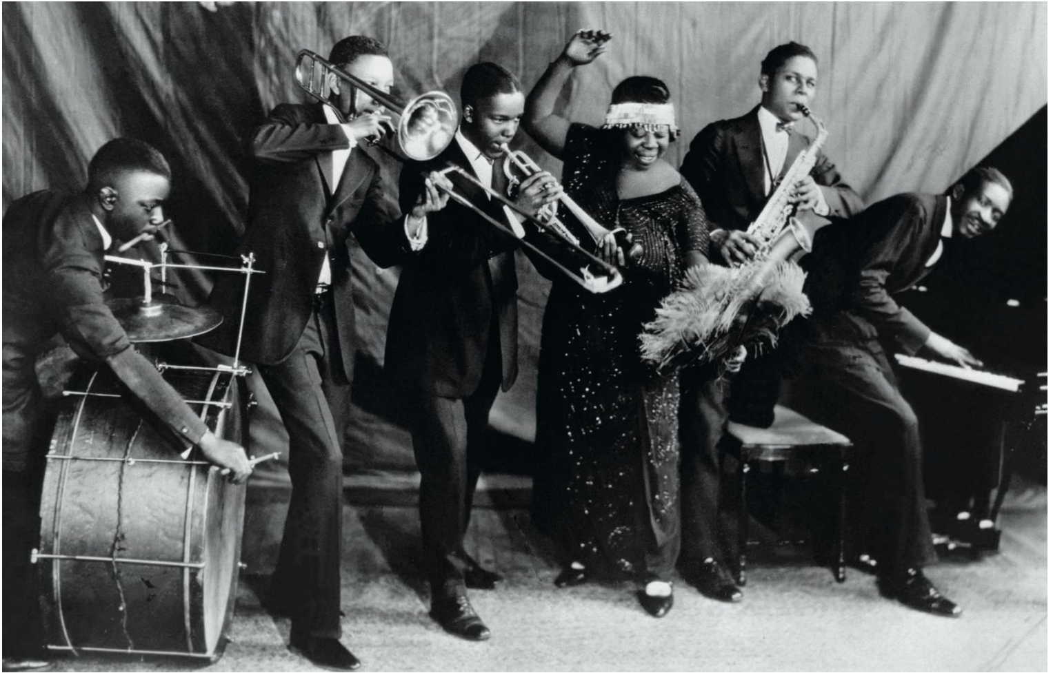
Ma Rainey, an early blues singer who performed in black minstrel shows, with her band.

before. What they saw caused a permanent sensation. He reportedly won 20 encores.