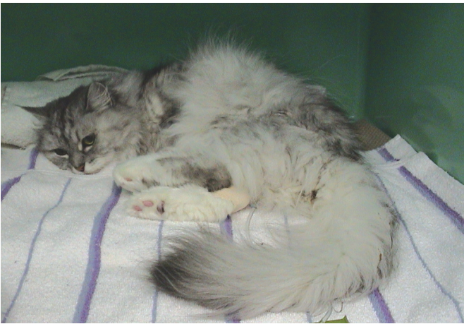
Figure 1 Myositis in a cat caused by T. gondii cysts. The cat presented in lateral recumbency, was unable to get up, and showed severe muscle hyperaesthesia.