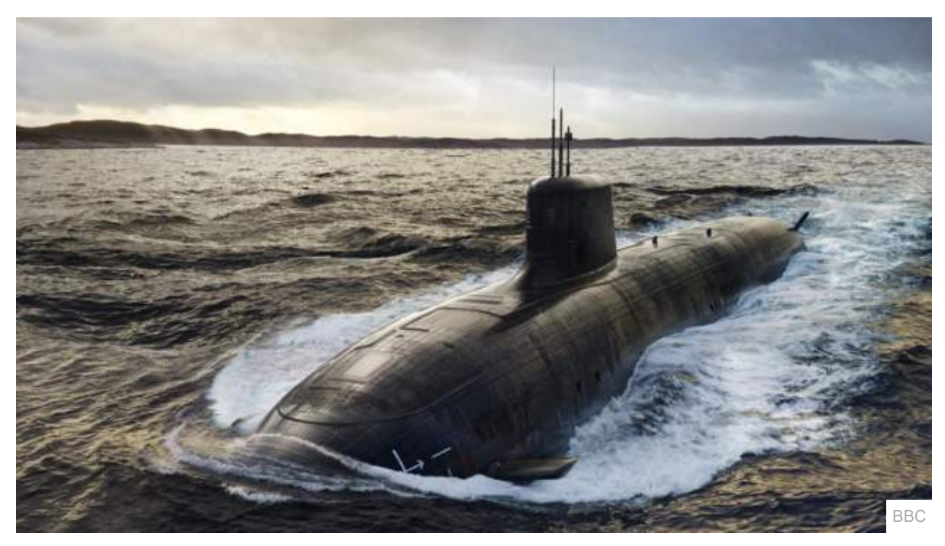
Mocked-up images of the new SSN-AUKUS submarine

Dubbed the SSN-AUKUS, the new model of nuclear-powered attack submarine will be built in Britain and Australia to a British design.